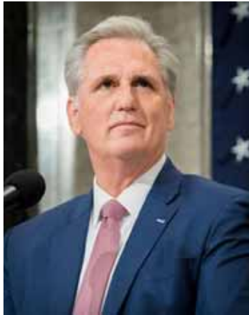
Rep. Kevin McCarthy

Virtually all will claim – without basis – “asylum,” be given an “appearance” date before an asylum judge, months if not years in the future, then forever disappear into the Nation’s interior, never to fret again about being cared for by Democrat regimes. George Soros and Saul Alinsky would be very proud. Oh, and the Goofball, too.